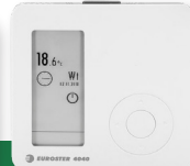
SMART EUROSTER Digital Controls