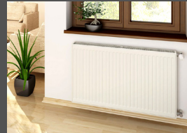
Radiant Panel Heating